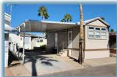
C-391 $79,875 PET-YES AZ room -NO 2023 RGN-Rosa