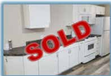
K-630 $65,500 PET-NO AZ room -YES 1990 Sandcastle