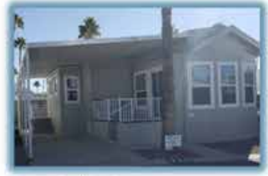
O-715 $93,500 PET-NO AZ room -YES 2015 Schultz

We have many more units available for sale. Call our sales team today!