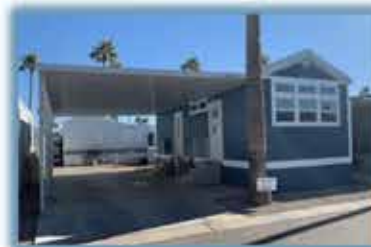
D-425 $79,875 PET-YES AZ room -NO 2023 RGN Rosa