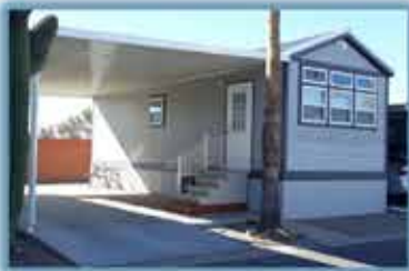
B-52 $79,875 PET-YES AZ room -NO 2023 RGN