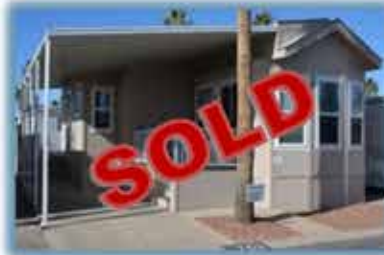
O-701 $93,500 PET-NO AZ room -YES 2015 Schultz