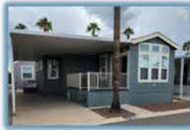
G-290 $98,500 PET-NO AZ room -YES 2019 Champion Sonoran