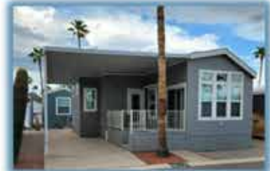
H-302 $94,500 PET-NO AZ room -YES 2017 Champion SpringCreek