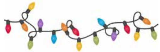
2022 RCW CHRISTMAS