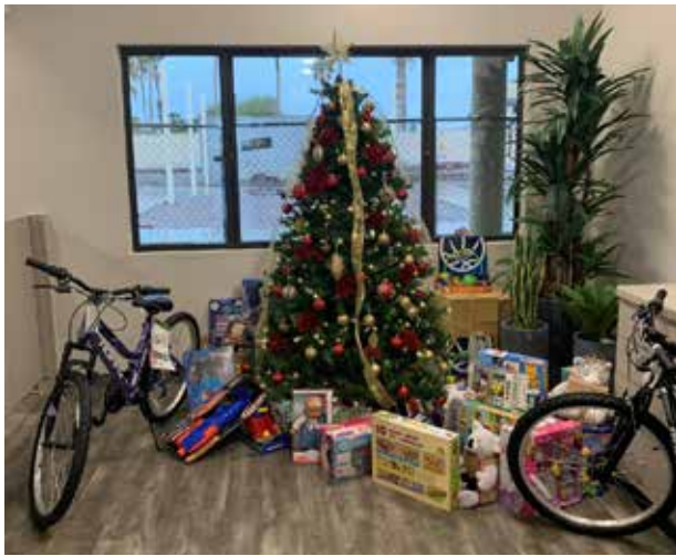
TOYS FOR TOTS