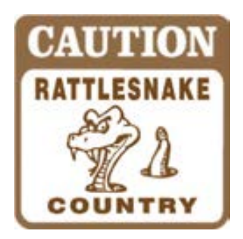
Safety from Wildlife

We have one Automated External Defibrillator (AED) device. The device is located in the Breezeway near the Office. Stay tuned to The Villager for upcoming CPR and AED classes. You could save a life!