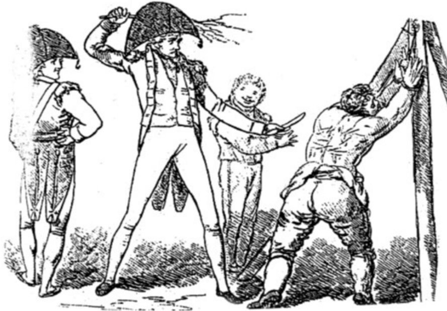
The earliest record of the use of the dreaded "triangle" in Tipperary was at Templederry.