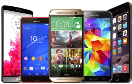
The phones that 6 year old children use today.