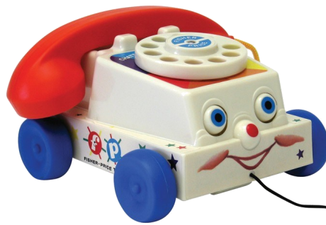
The phone I used at 6 years old.