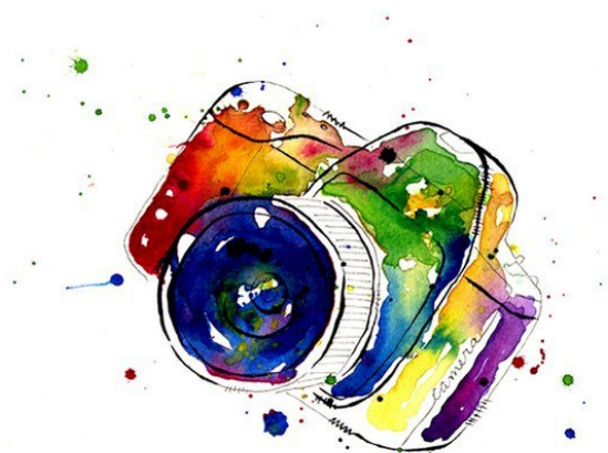
Photo Club Meeting

People bring their own supplies and projects. All levels and abilities are welcome. Last year we had people who worked with watercolors, pastels, colored pencils, pen and ink, acrylics, oils, and stained glass. If you enjoy the "adult coloring books" you are more than welcome to join us. Have a different art medium...come and join us, we'd love to see what you do.