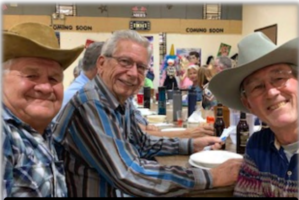
Astronomy Club Horse Races

RCE Clubs are the best! Not only do we offer a huge variety of clubs to choose from, but our clubs also put on some great events during the season for sure! Here are some pictures from the various clubs and events throughout the season.