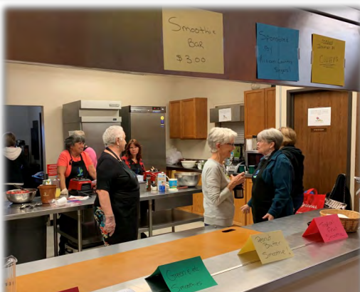
Smoothie Bar by Rincon Country Singers