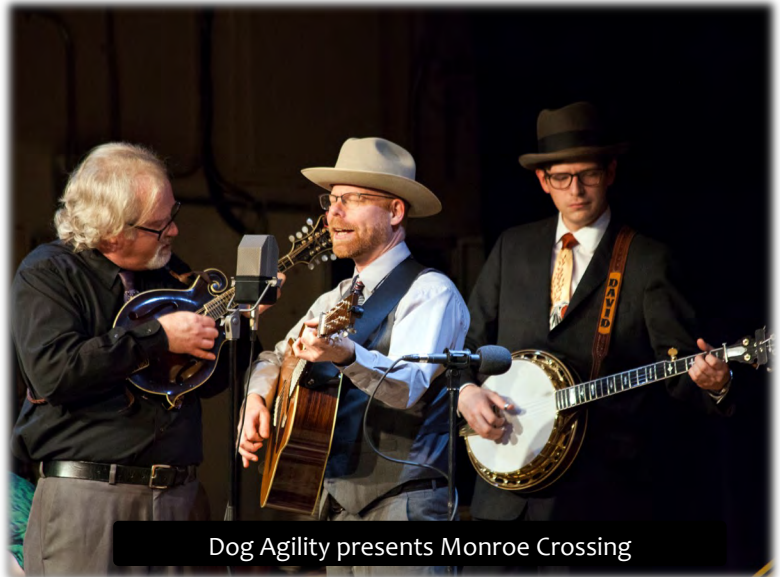
Dog Agility presents Monroe Crossing