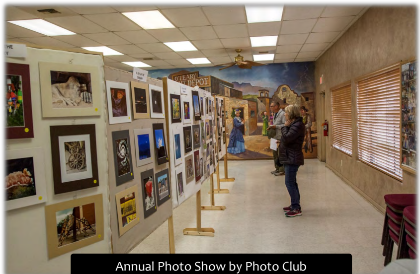
Annual Photo Show by Photo Club