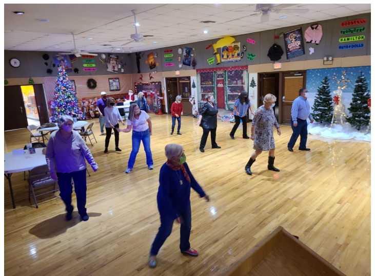
Our RCE Line Dancers electric sliding across the dance floor.