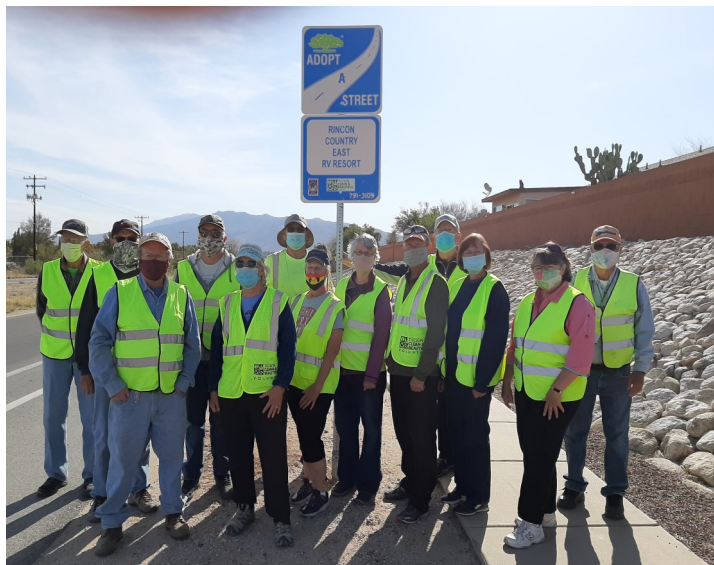
The RCE Rincon Roadies helped to keep the streets outside of RCE beautiful and litter free.