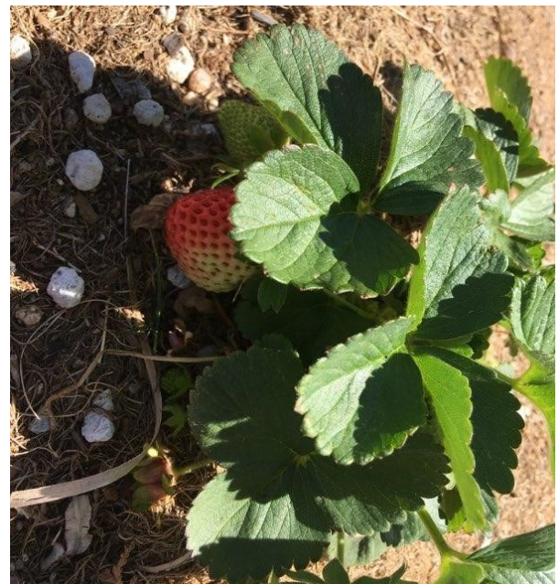
Check out this delicious looking strawberry!