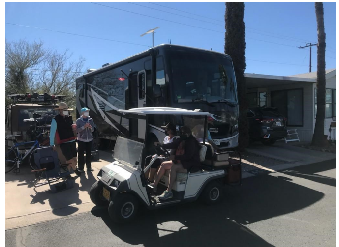
The Shuffleboard Club delivered ice cream and milkshakes this season right to people's rigs/doors. Yum!