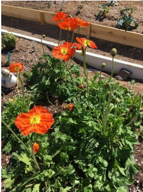
Poppies in the community garden.